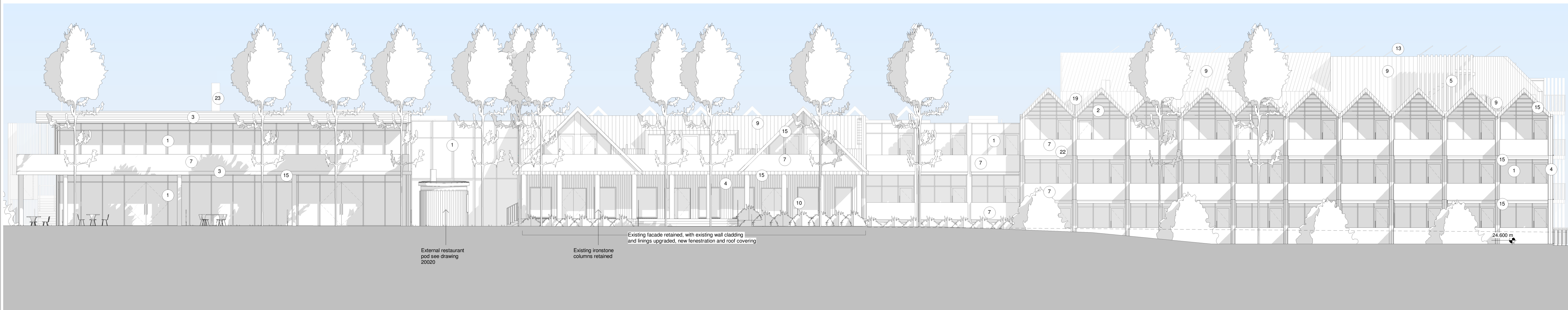
Proposed East Elevation 1 : 100