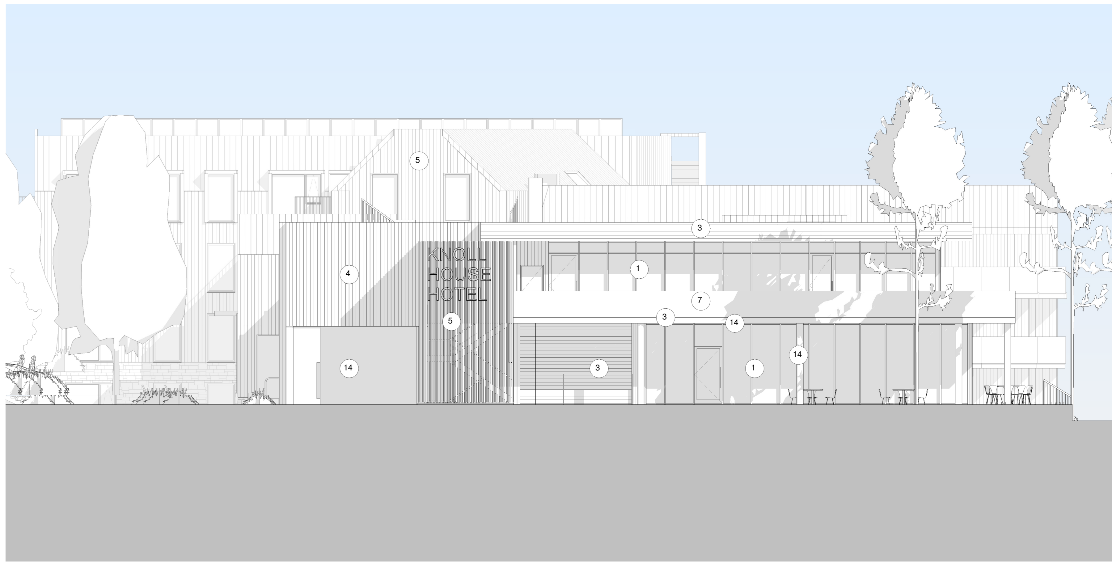
Proposed South Elevation 1 : 100