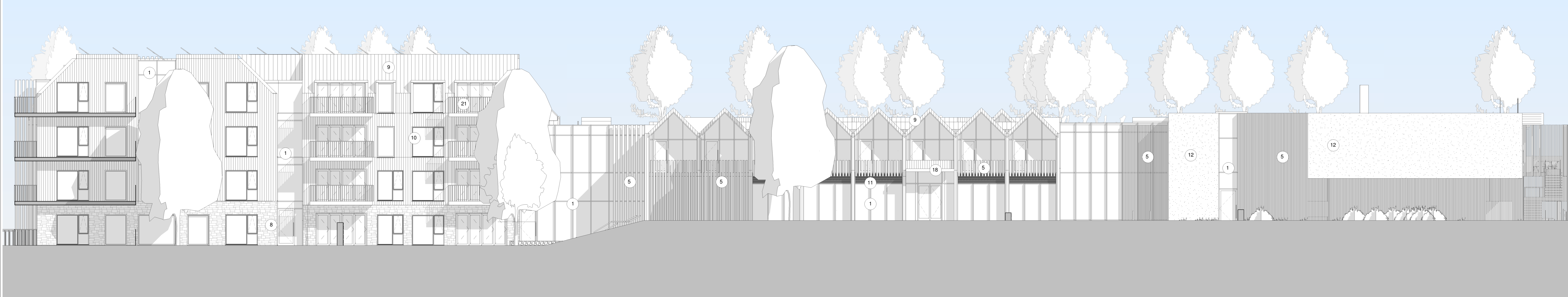
Proposed West Elevation 1 : 100