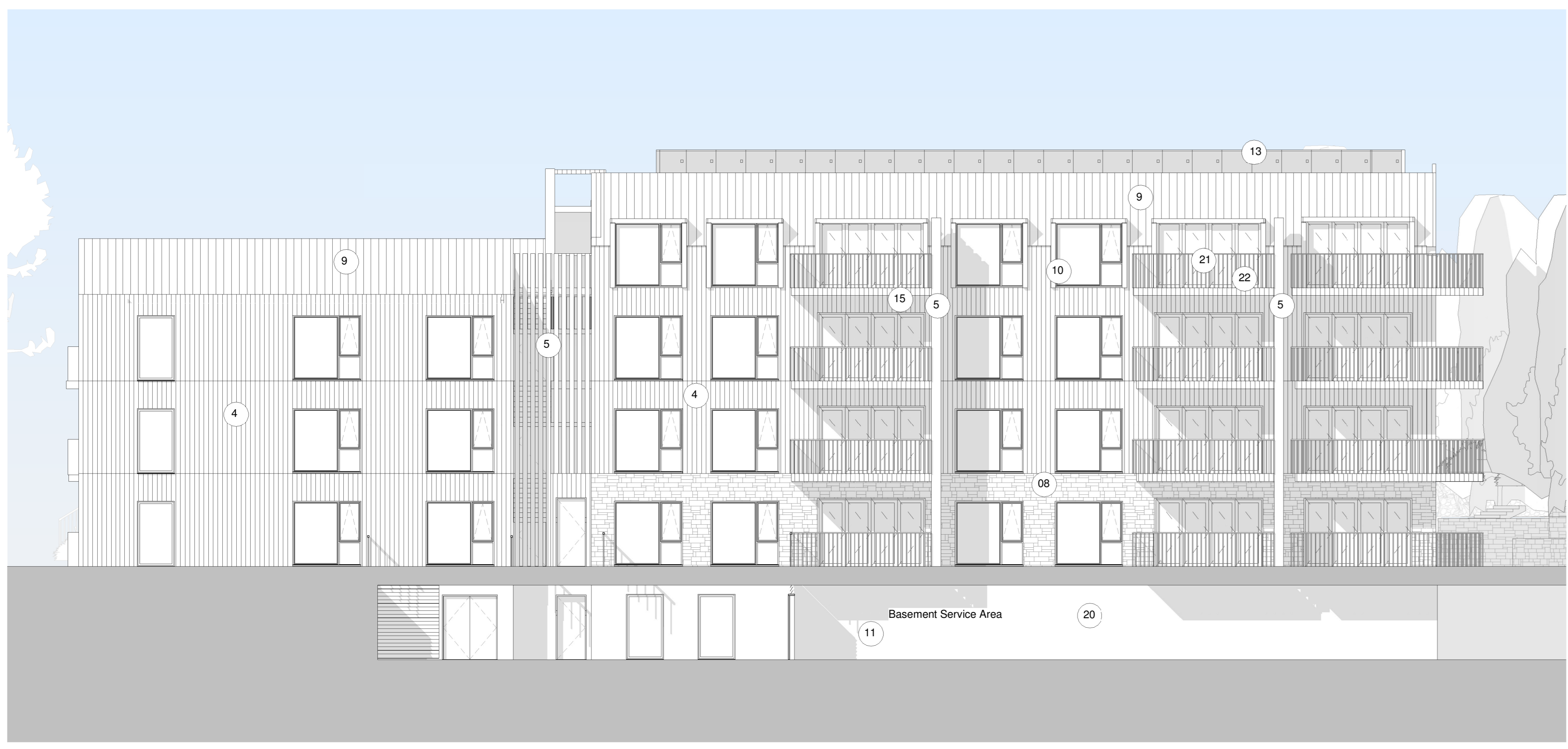
Proposed North Elevation 1 : 100